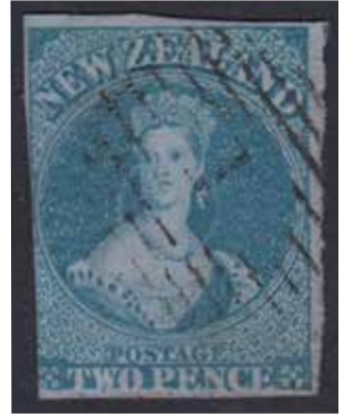
SG5 2d Overlap 315(c)