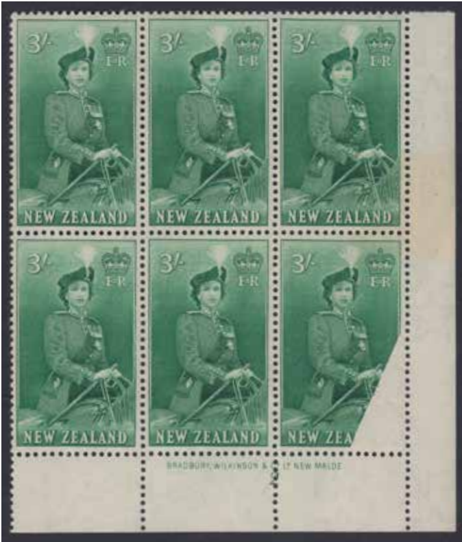
3/- Queen 'NEW ZEALAND'. 319(t)