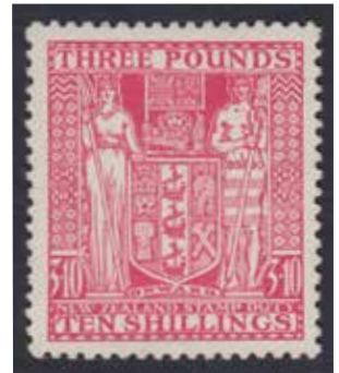
£3/10/- Arms 321(r)

CP'S NEW ZEALAND STAMPS - WELCOME TO OUR TRADITION