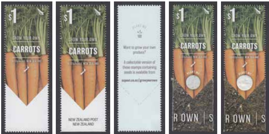
no seeds, white

S1732a-S1737a, S1732a(z)-S1737a(z), S1732a(y)-S1737a(y), SM1732/7A, SM1732/7B